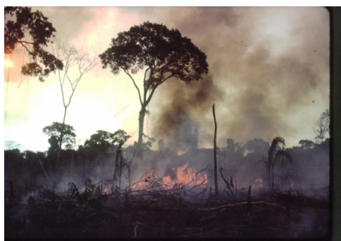
Fig. 1 | Amazon forest on fires. (Picture: Philip Fearnside). https://amazoniareal.com.br/queimadas-batem-recorde-em-agosto-na-amazonia/ .